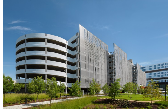
Picture 2: The elongated, narrow design of the parking deck leaves maximum space for green areas and relaxation zones.