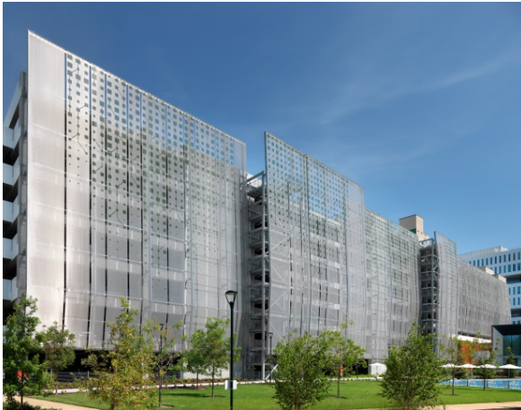
Picture 1: The open parking deck is encased by printed stainless steel mesh panels from GKD measuring up to 27 meters high and three meters wide.