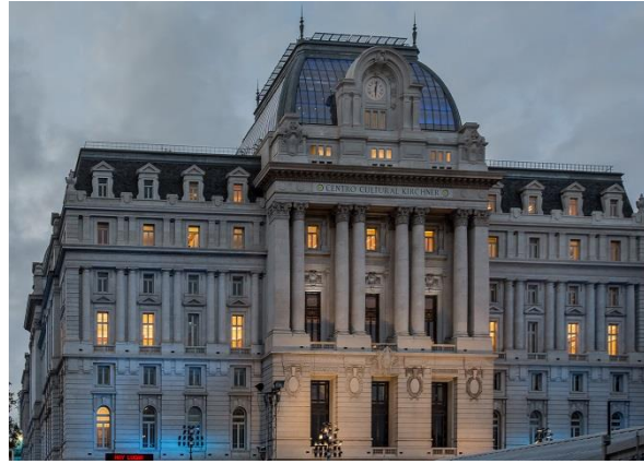
Picture 1: With the opening of the Centro Cultural Kirchner, Buenos Aires boasts the largest cultural centre in Latin America.